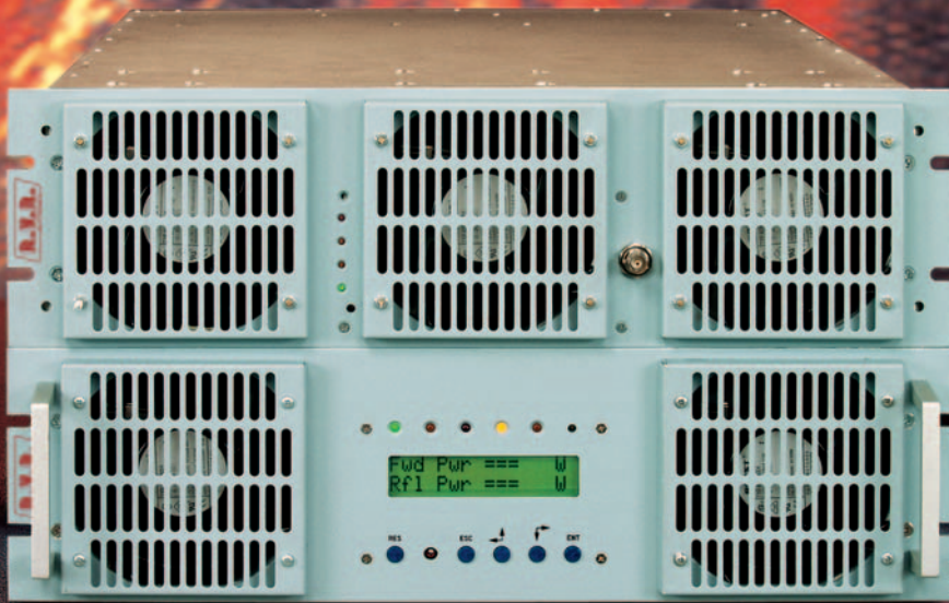
FM Mosfet Amplifier 87.5-108 MHz range

AMPLIFIERS TRANSMITTERS ANTENNAS ACCESSORIES